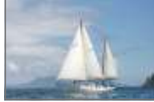
Herreshoff 36 $75,000 A Yacht Built To Cruise with Enough Room For Everyone.