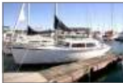
Shoalcraft 10m $42,000 Good 1st yacht, Plenty For Fun To Be Had Out On The Water.