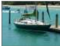
Salthouse Cavalier 32' $48,000 Launched 1974, NZ Reg, A Very Well Cared For Yacht.