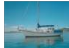
Herreshoff 28 (H28) $30,000 Launched 1980, A Top Example Of This Well Sort After Design.