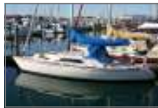
Spencer 33 $35,000 Yanmar 2007 21HP Diesel with Only 224Hrs A Perfect 1st Yacht, A True Kiwi Classic.