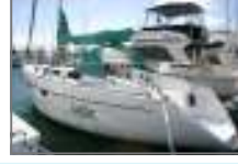
Jack Taylor 38 $69,000 Family Yacht That Will Sail Shallow Waters, Ideal For Harbour, Sounds, Gulf, Bay Of Islands Etc.