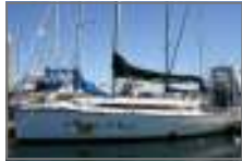
Flanagan 11m Performance Yacht $75,000 Launched 2002-03, Harbour and Coastal Performance