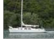
Stewart 34' $39,000 A Very Tidy and Well Presented Vessel That Belies Her Age. Vendor Invites Enquiries