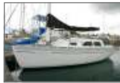
Lidgard 8m , $40,000 Used Around NZ & Stewart Island, Beautiful Interior. Make A Great Single Hander.