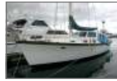
Hartley Tahitian 46' $45,000 Ferro Hull, Interior Needs Finishing Huge Potential.