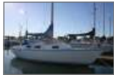
Dobson 32' $49,000 Bukh 20HP Diesel (Served June 2011) Excellent Entry Level Yacht!