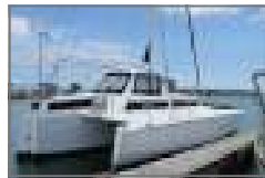
40' Modified Sea Runner Trimaran $36,500 Very Affordable Large Vessel With Lots Of Potential